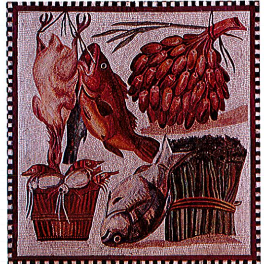
Fish, Chicken, and assorted goods